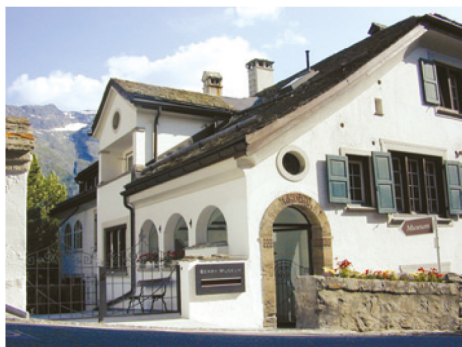
Villa Arona, St. Moritz