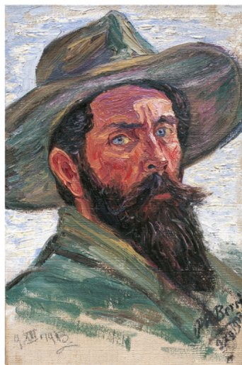
Self-portrait with hat, 1913 oil on canvas (27 x 41 cm)