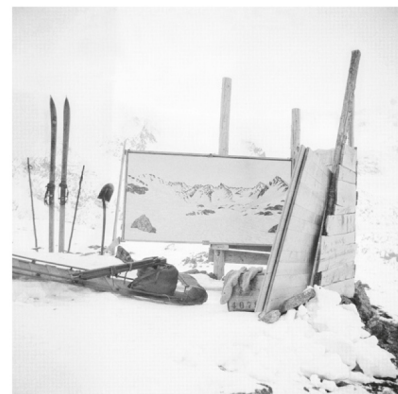
Studio in the snow, Bernina Pass 1908